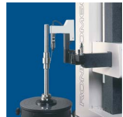
Fully Automatic Detector Holder (option) (Patent pending)