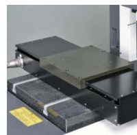
Y-axis CNC table (200mm)