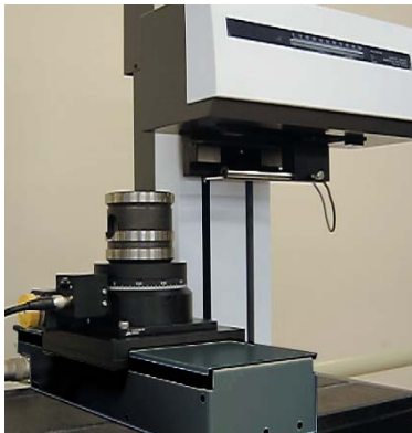
Example of Y-axis CNC table (100 mm) and \theta -axis CNC table (horizontal) combination