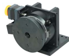
\theta -axis CNC table (Vertical)