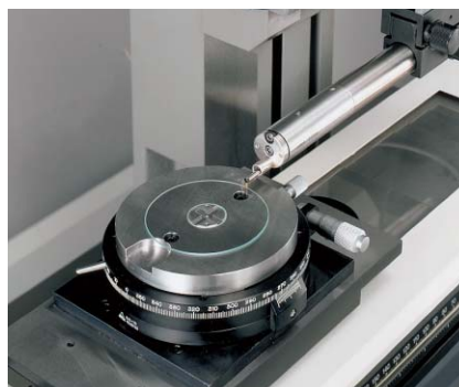
Measurement of hard disk using SURFCOM 480A

Dedicated software available for SURFCOM 480A.