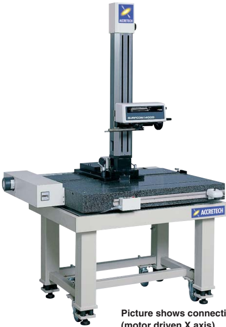
Picture shows connection with SURFCOM 1400D (motor driven X axis) * Anti-vibration table is optional.