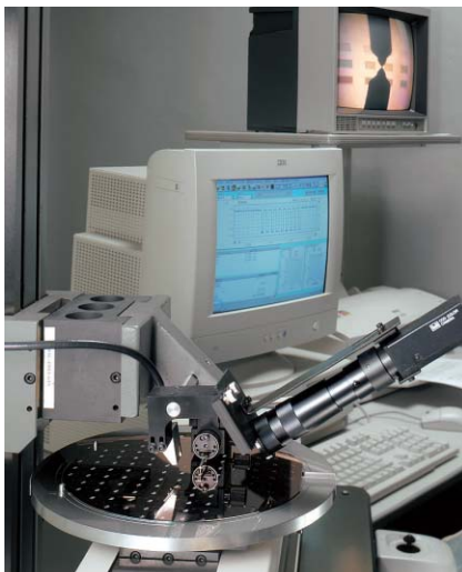
Sample configuration with SURFCOM 1400D and CCD camera