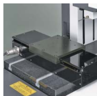
Y-axis CNC table (100mm)